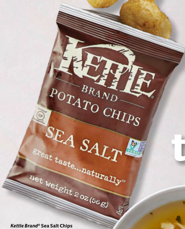
Kettle Brand® Sea Salt Chips pairs well with a turkey sandwich or Campbell's® Culinary Reserve Chicken Noodle Soup