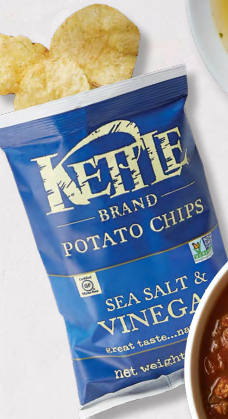
Kettle Brand® Sea Salt & Vinegar Chips pairs well with a veggie sub or Campbell's® Culinary Reserve Hearty Beef Chili with Beans