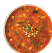
27445 Campbell's® Signature Healthy Request® Reduced Sodium Vegan Vegetable