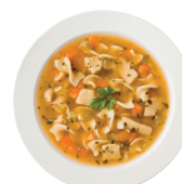
27443 Campbell's® Signature Healthy Request® Reduced Sodium Chicken Noodle

FULL OF FLAVOR. NO SODIUM. only 390 MG OF SODIUM PER SERVING 1