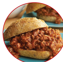
Sloppy Joe Sliders featuring 04145 Campbell's® Healthy Request® Tomato Soup