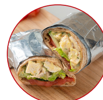
Chicken Salad Wrap featuring 04143 Campbell's® Healthy Request® Cream of Chicken Soup