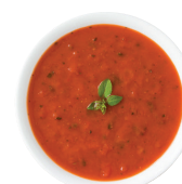
27444 Campbell's® Signature Healthy Request® Reduced Sodium Tomato Basil