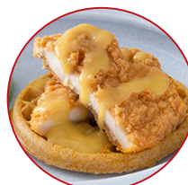
Chicken and Waffles featuring 04143 Campbell's® Healthy Request® Cream of Chicken Soup