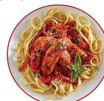
Chicken Cacciatore featuring 27444 Campbell's® Signature Reduced Sodium Tomato Basil Soup

FULL OF FLAVOR. NO SODIUM. only 390 MG OF SODIUM PER SERVING 1